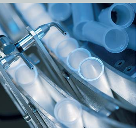
Detail Spiral conveyer