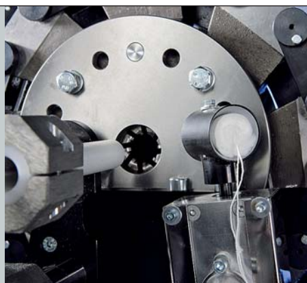
Soft roll transfer to press